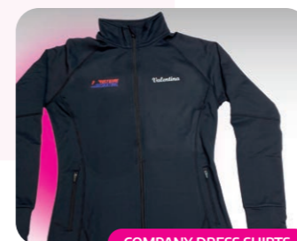
COMPANY DRESS SHIRTS